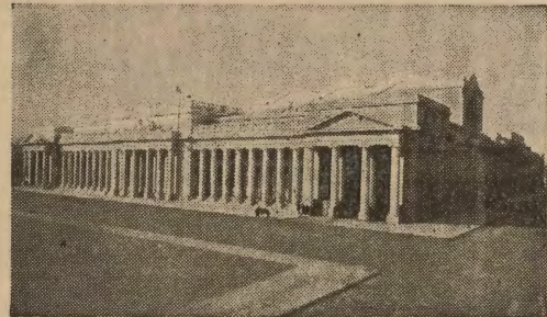
SEVENTH AVENUE AND THIRTY-SECOND STREET